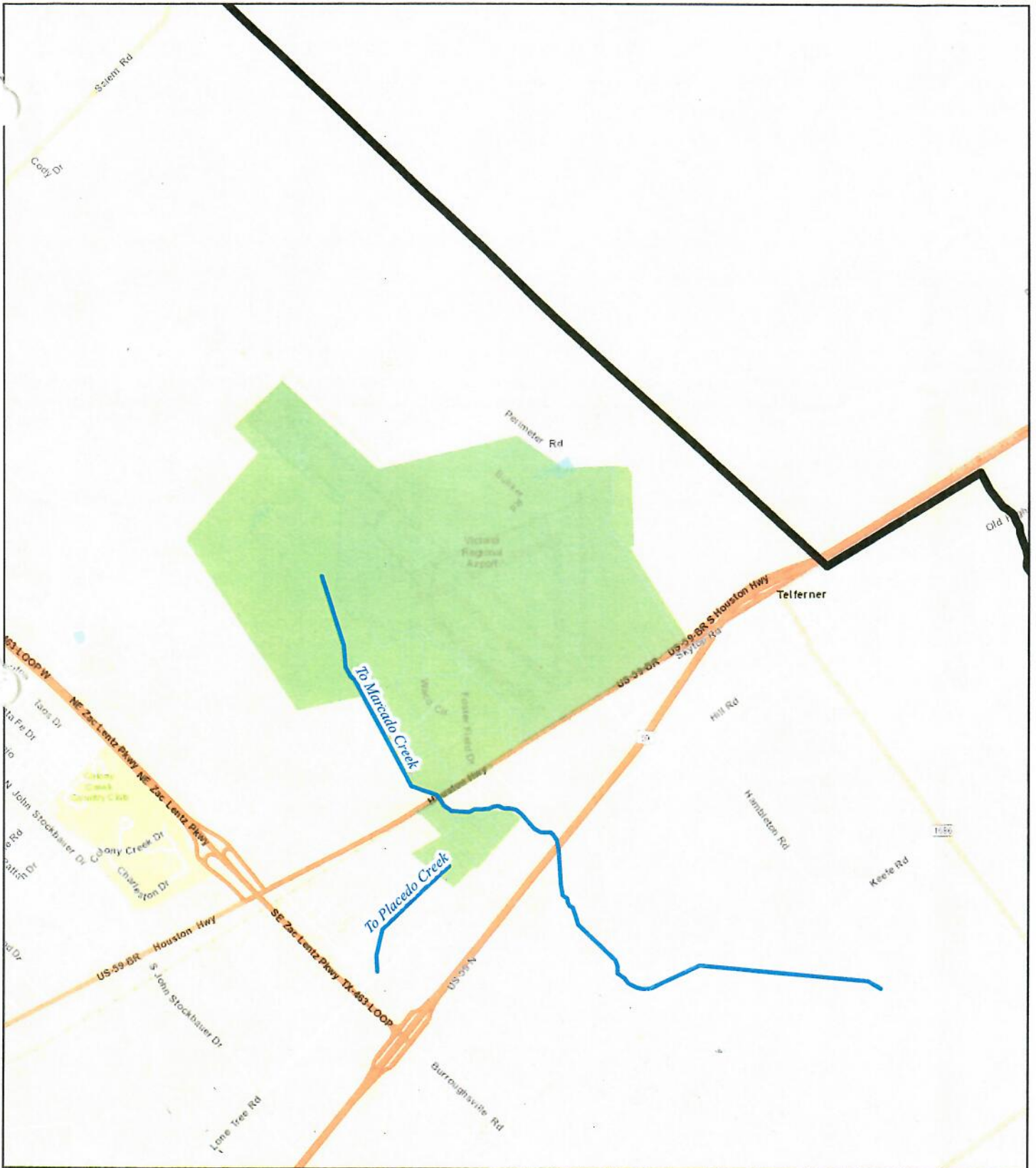
Figure 3: Victoria County MS4 Outlets